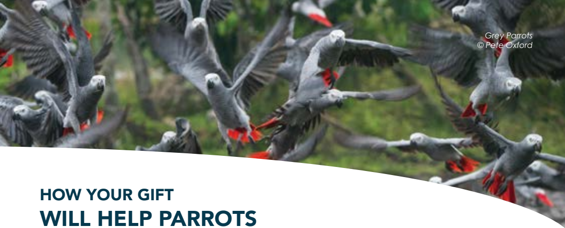
Grey Parrots © Pete Oxford